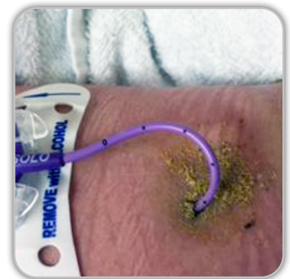
Above: StatSeal Powder remaining after dressing removal