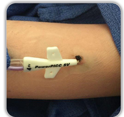
Below: Seal remains at access site after cleaning