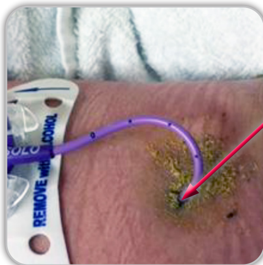
Loose StatSeal remains after dressing removal

Reapplication of powder is ONLY needed if seal has been disrupted and bleeding or oozing occurs.